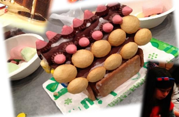
Kids enjoyed making their very own candy house